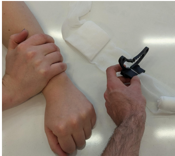
Table 1: Suggested application procedure from our limited testing :

Step 1.a : Clip the lever on the compressive bandage, while holding pressure on the victim's wound (if they are conscious they can apply pressure themselves).